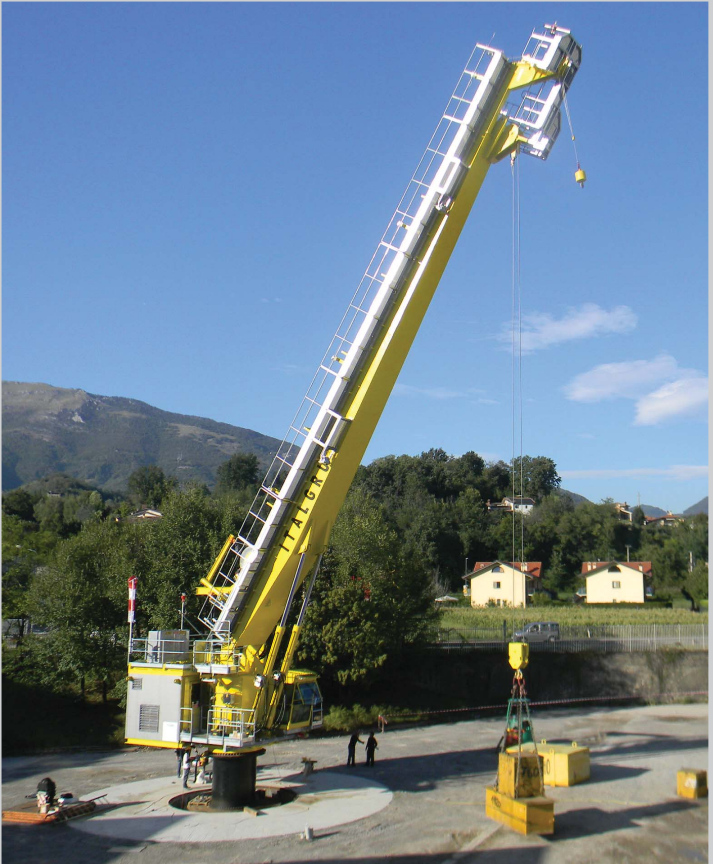
Box Boom Crane Type TC 500 DH - HST Platform PTSC Vietnam