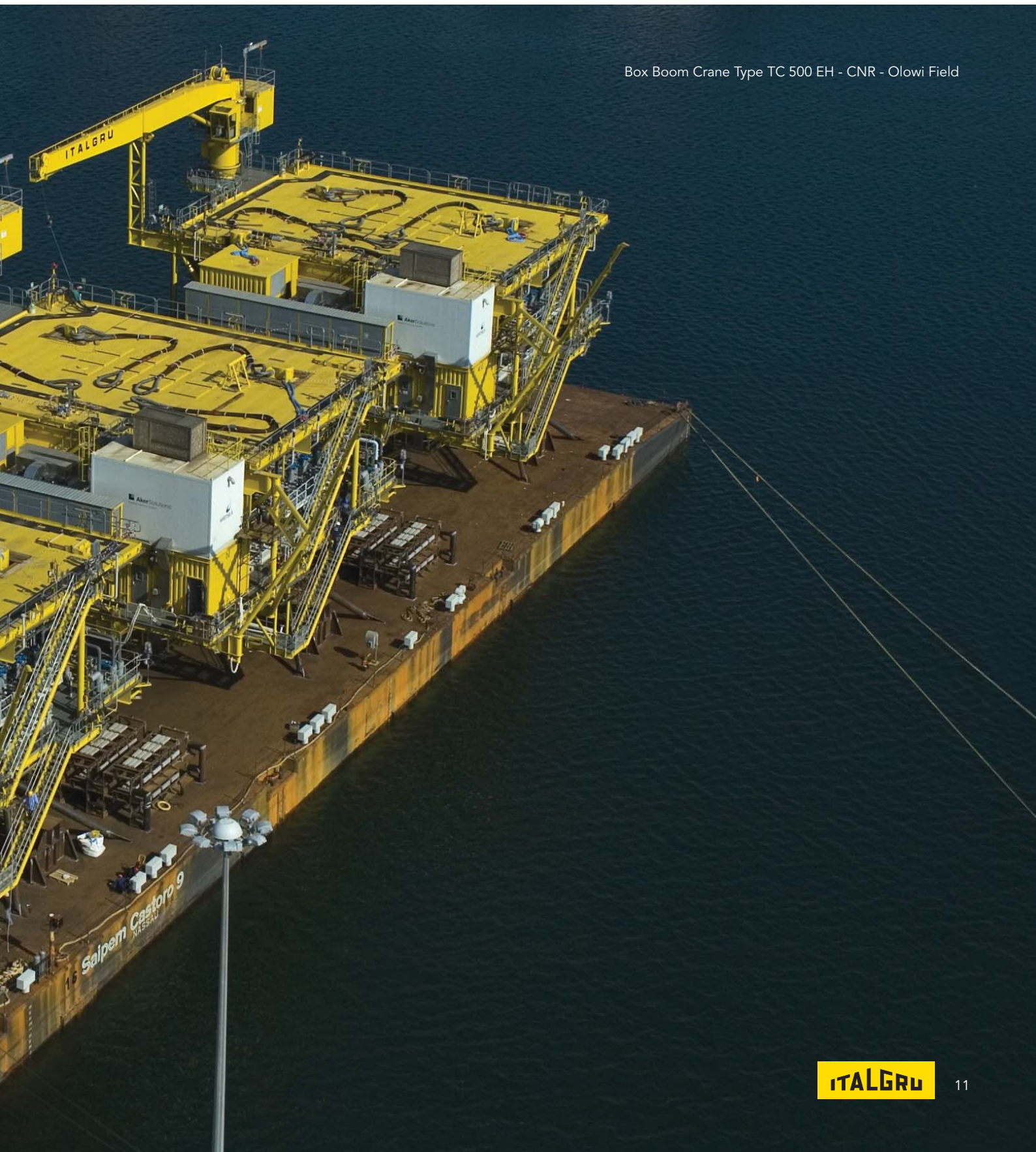
Box Boom Crane Type TC 500 EH - CNR - Olowi Field