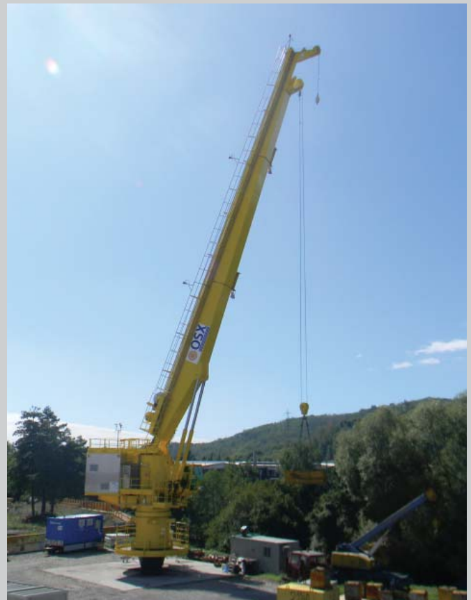
Box Boom Crane Type TC 1200 EH - SBM - FPSO OSX 2