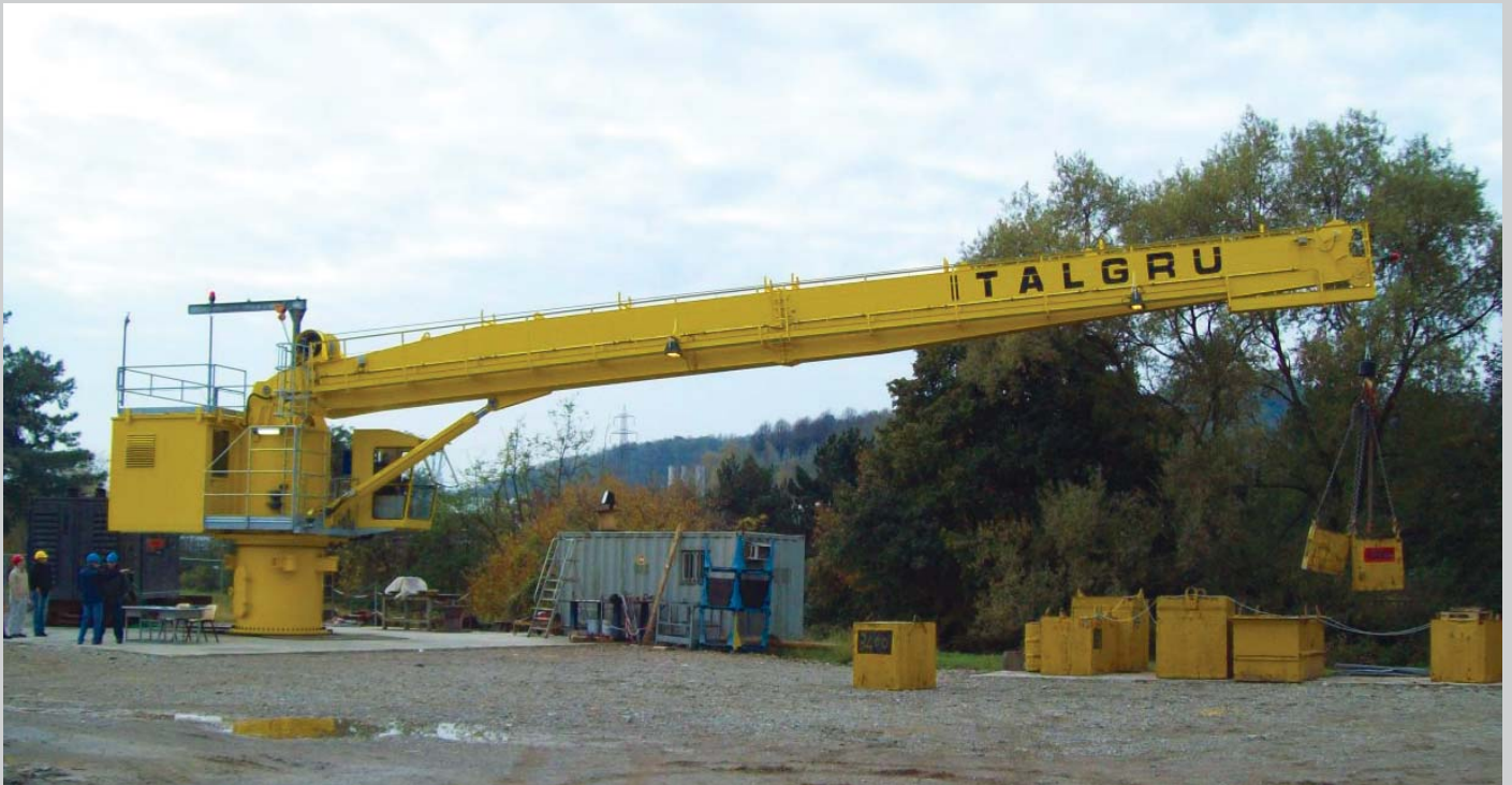
Box Boom Type Pedestal Crane TC 180 EH – Saipem – CNR – Olowi Field Platform

Tel. +39 - (0) 35.49.32.411 Fax +39 - (0) 35.49.32.409 info@italgru.com / www.italgru.com